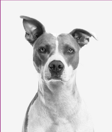
Get Your Pet Vaccinated Against Rabies!