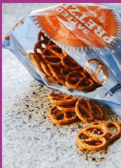
Look for healthy snacks that are low in sugar.

ham crackers- choose ones with 0 trans fat, Low fat putting cup, 100% fruit juice boxes, Dried fruit made with 100% fruit, Add pretzels and nuts to WIC cereal to make a tasty trail mix.